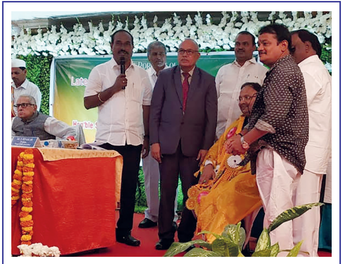
Chairman of Komandur Group of Schools honoured by the AP High Court Judge Justice Ganga Rao