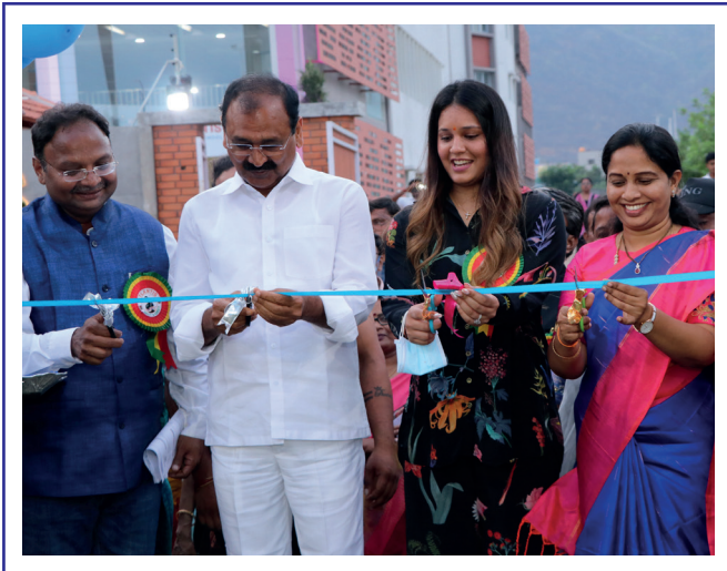
Chairman of Komandur Group of Schools with World Squash Champion & Arjuna Awardee Dipika Pallikal Karthik , during the inauguration of our Sports Arena