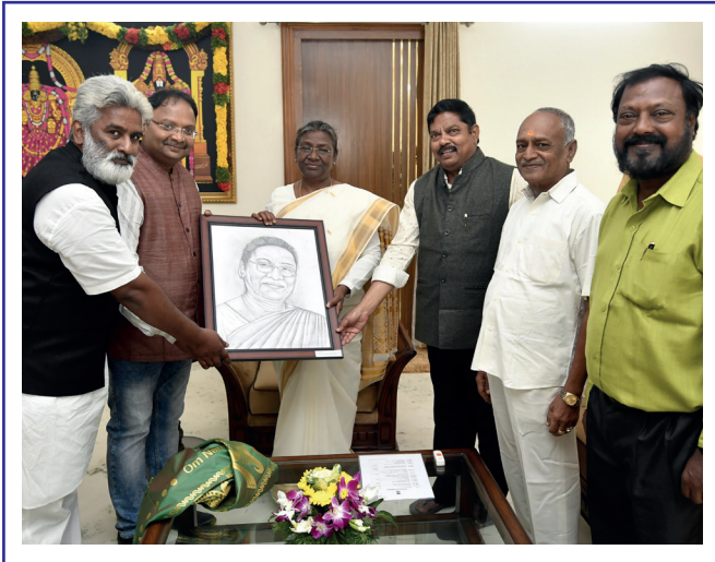
Chairman of Komandur Group of Schools with Her Excellency Draupadi Murmu , Hon'ble President of India